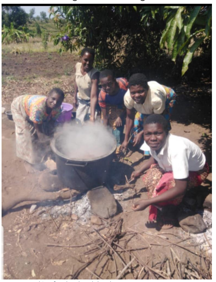
Women cooking for the church luncheon.

In Thekerani is a very wonderful man who is very devoted to ministering to the children. He often brings them to his home and teaches them Bible lessons, along with tutoring them in different school subjects as they need