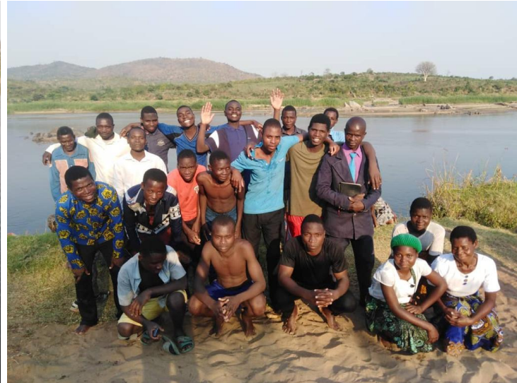
Group Ready for Baptism.