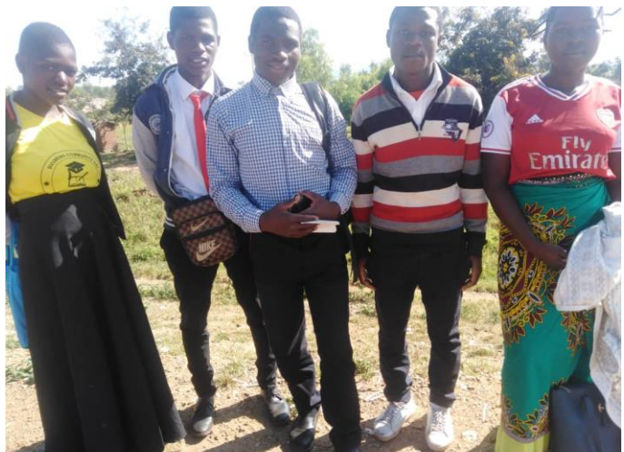
An outreach team

We have planned, and God willing, we will be having two more outreaches this month of May.