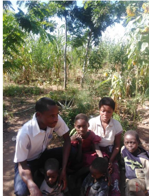
Navincha doing a visitation