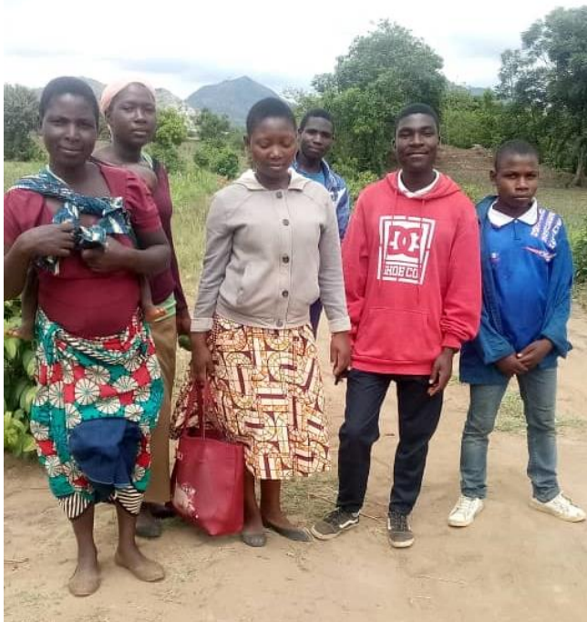
Members ready to climb the mountain

The members in Bvumbwe have taken two trips to the mountain to pray and have also been visiting those who have been backsliding, sick, or who simply stay far and sometimes struggle to come as they would desire. Praise God for unity!