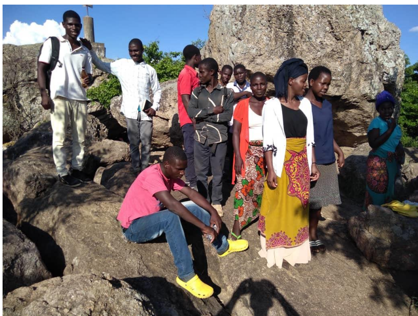
On the top of the mountain