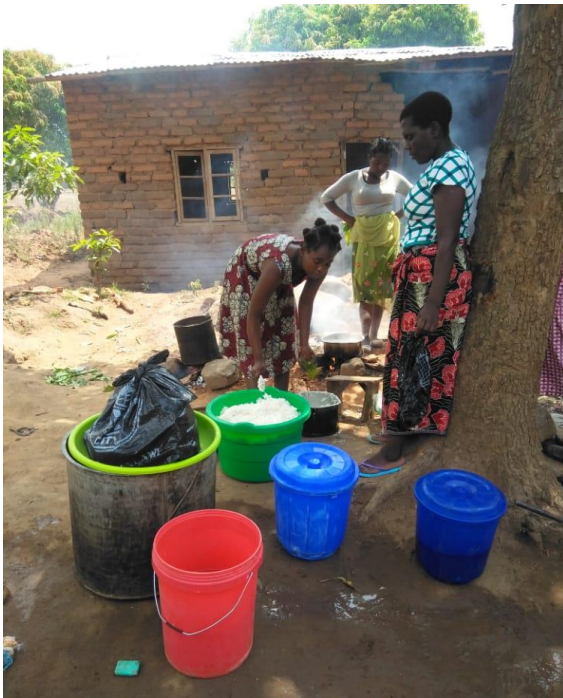
Food preparation for one-year anniversary celebration

the people. Malawi has been in drought, and they did not have the harvest that they usually do. Sometimes they can rely on bananas, but in the last years they have been diseased. Pray for God to provide for them in special ways.