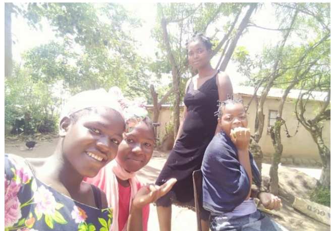
Girls doing a visitation