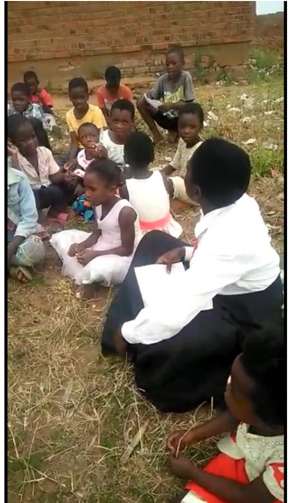
The one-year anniversary celebration

Other testimonies come because of this, too. One family from our ministry praise God for a new house, and they know God alone has provided it!