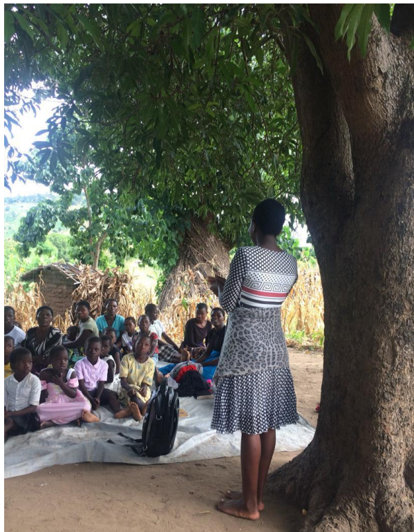
One of the youth girls teaching the children

to a district about 2 hours away, Phalombe. We have been planning for a few weeks and are excited to see another opportunity for the youth, and the ministry, and the Kingdom to grow. May God be glorified. This should happen around the end of May!