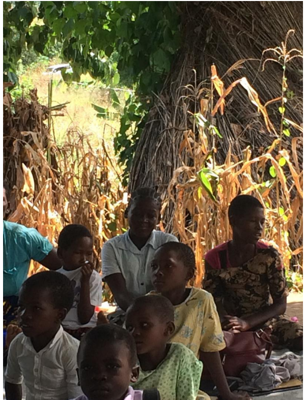
Picture from the trip to Thekerani

We are planning soon to take some of the youth on an evangelistic outreach